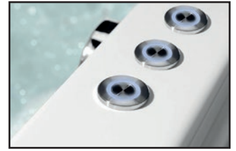
ATTRACTION HYDRO AIR + COLOR THERAPY