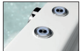
ATTRACTION HYDRO AIR