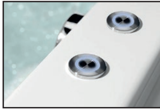
ATTRACTION HYDRO + COLOR THERAPY