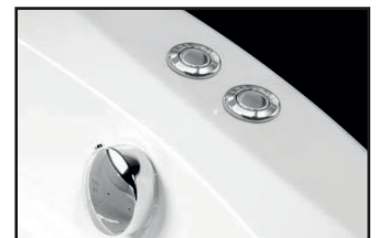
ACTIVE HYDRO AIR