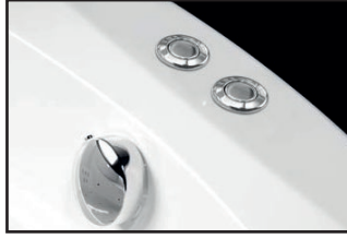
ACTIVE HYDRO + COLOR THERAPY