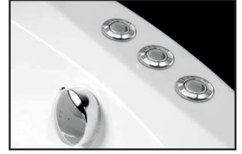
ACTIVE HYDRO AIR + COLOR THERAPY